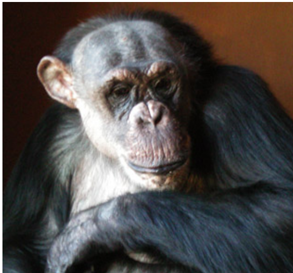
Figure 1. Negra on her first day at Chimpanzee Sanctuary Northwest, after 30+ years in research.

Even after decades of laboratory life, chimpanzees literally transform in sanctuaries: